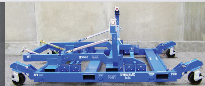
CFM56-3 engine stand - This engine stand continues to solve engine transport problems for some of the biggest names in aerospace manufacturing and maintenance.